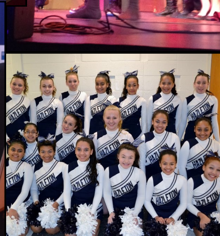
2013-2014 HEMS Mountaineers!